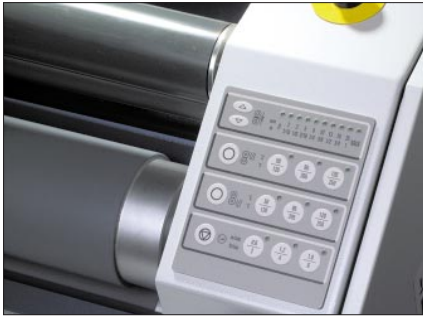
Touch pad control panel with predefined settings for temperature, speed and substrate thickness.